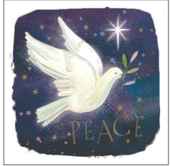
1. PEACE DOVE 121mm x 121mm £3.00