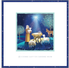
4. O COME LET US ADORE HIM 121mm x 121mm £3.00